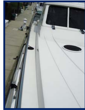
Side Deck Starboard Side