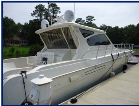
Starboard Aft Quarter