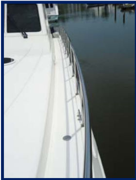
Side Deck Port Side