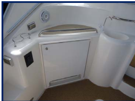
Aft Deck Refrigerator