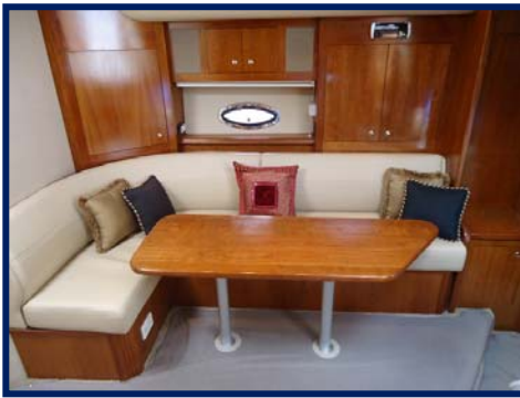
L-Shaped Couch & Wood Table