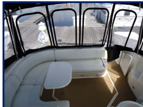
Aft Deck Dinette