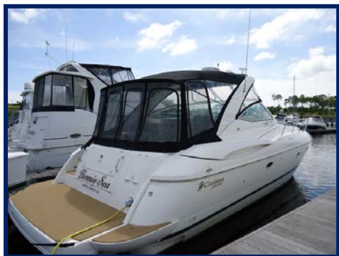
Starboard Aft Quarter