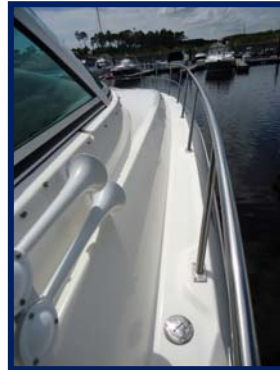
Starboard Side Deck