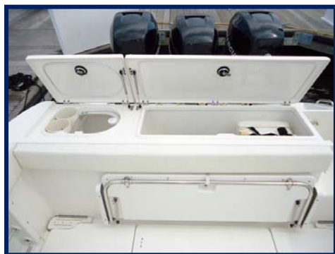
Transom Bait Station