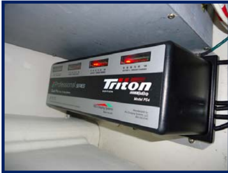
Triton Addition PS4 Battery Charger