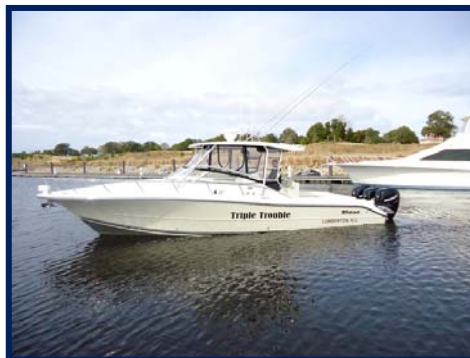
Port Side Profile