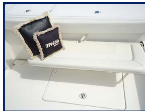
Pull-down Bench Seating