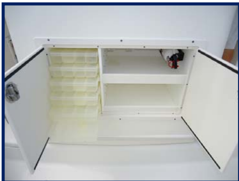
Tackle Center Open