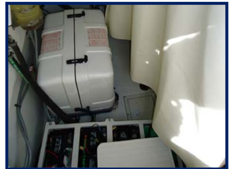
Generator with Cover On