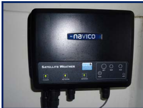
Navico Satellite Weather