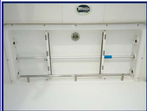
Dual Mounted Rod Locker