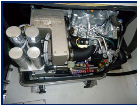
Generator with Cover Off