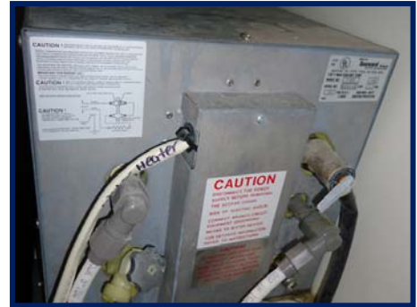
Electric Water Heater