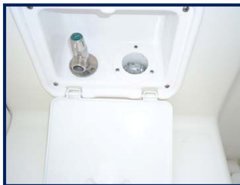
Fresh Water Wash Down