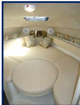
Converts to Bunk