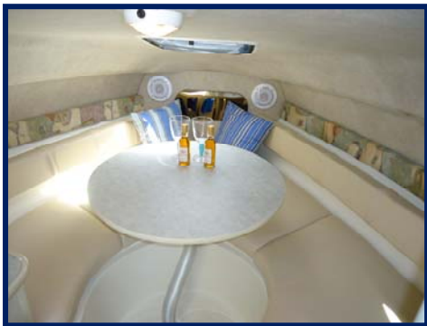
Forward V-Berth Dinette

Entering from the swim platform you go through the cockpit door and are greeted with the wide bench seat to starboard and removable table. On the port side is a cooler compartment and an aft facing lounge. At the helm you have a back-to-back seat big enough for two on each side. There is also a step to access the bow located under the helm. The entire cockpit can be covered with the bimini top or completely enclosed with the full camper canvas. Continuing forward you step down into the cabin that will surprise you for a 24' boat. The four port holes and deck hatch give the cabin ample natural light and a much more open feel. To port is the galley comprised of a stainless steel sink, refrigerator/freezer, an electric/alcohol stove, ample counter space and cabinets above the counter. To starboard is the enclosed head with handheld shower and sink. The forward berth has storage under each cushion and converts to a dining area. There is an additional mid-cabin berth with full size mattress and nice head room.