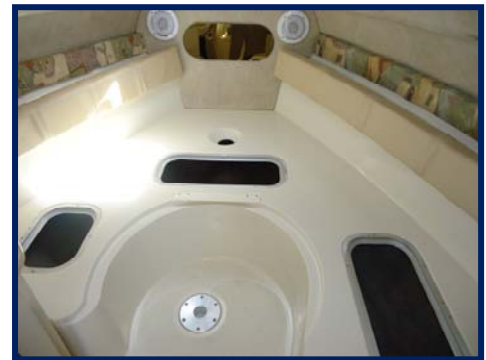
V Berth Storage under Cushions