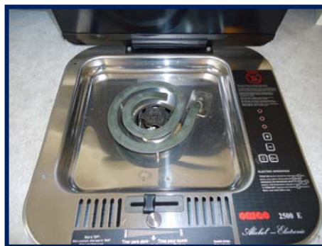
Alcohol-Electric 1-Burner Stove