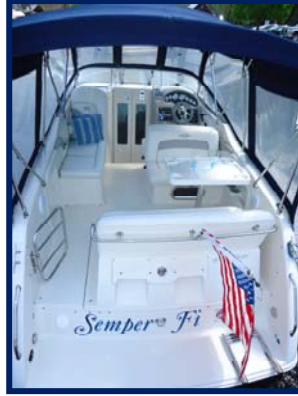
Cockpit Full View