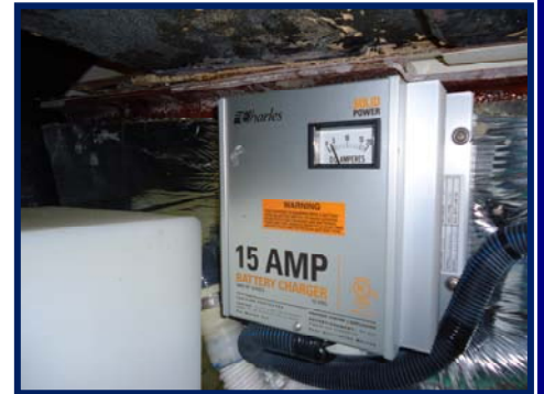
15 Amp Battery Charger